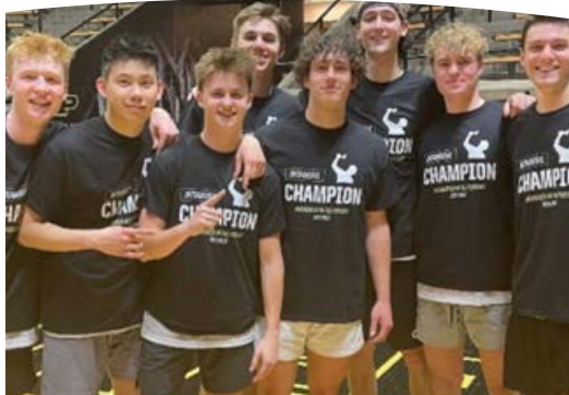
ΣΑΕ's intramural basketball championship team.