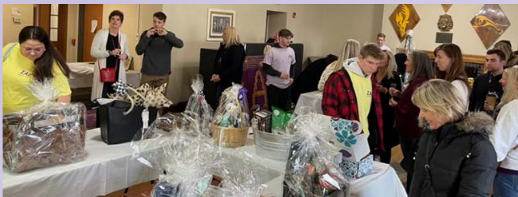
Our silent auction in progress on Mom's Day.