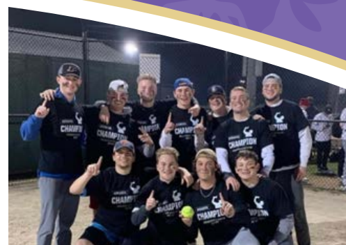
ΣΑΕ's intramural softball championship team.