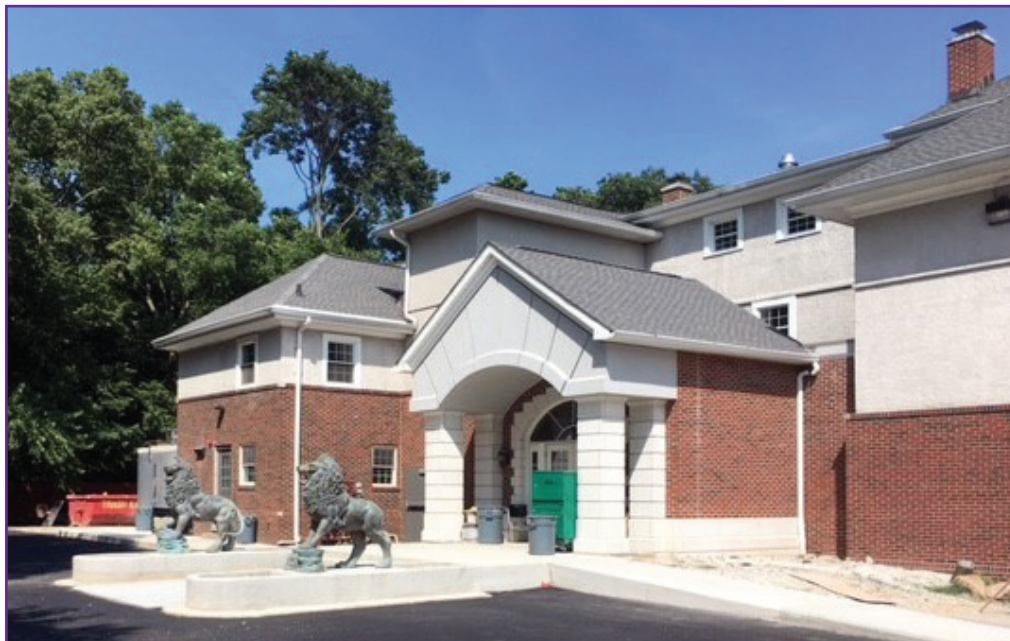
Over the summer, the parking lot was resurfaced and new lion statues were added to the secondary entrance to the chapter house.

Please do your part today by returning the enclosed pledge card with a gift to commemorate the time you