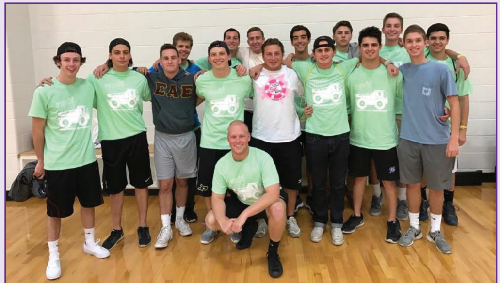
Indiana Betas participated in PUDM, helping raise more than $1 million for children in need.