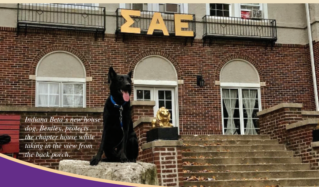
Indiana Beta's new house dog, Bentley, protects the chapter house while taking in the view from the back porch.