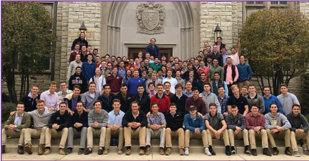
Left: Active brothers outside the Levere Memorial Temple at their annual brotherhood retreat.