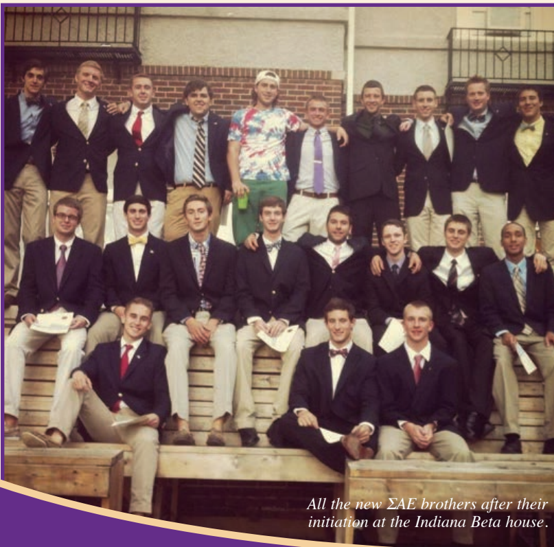
All the new ΣAE brothers after their initiation at the Indiana Beta house.

The Purdue Chapter of Sigma Alpha Epsilon is getting back into the swing of things after a relaxing summer. I truly believe this will be a great year and I know we will continue improving ourselves and our chapter, further bolstering our position on campus.