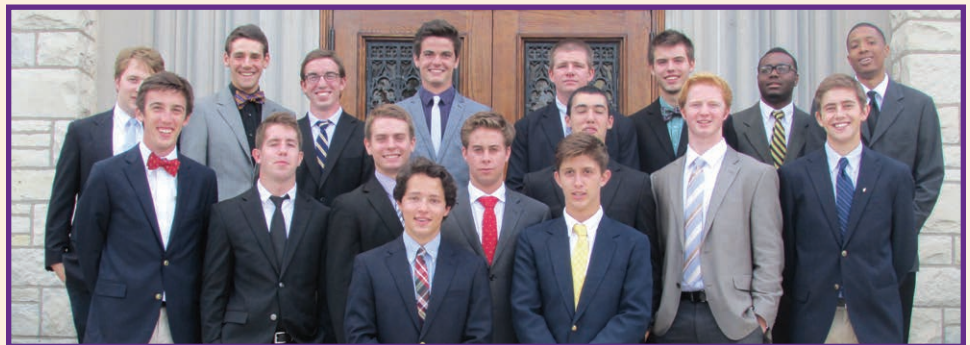
ΣAE brothers recently initiated. They were initiated at Levere Memorial Temple.