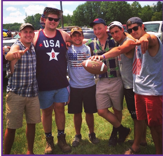
ΣAE brothers at a Purdue football tailgate.